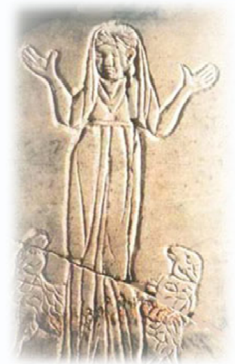
Archeological evidence of faithful women dating back to at least the 2nd century.